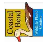
PHOTO FUN Workshops

711 N. Carancahua, # 120 Corpus Christi, TX 78475